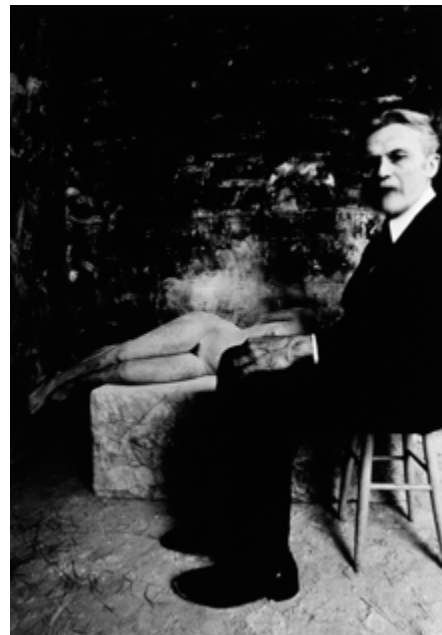
The Rape of Eurydice in the Attorney's Office, 1982-84