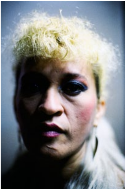
Rosa with Lipstick, 1993