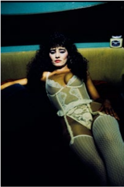
Woman with lace #1, Nuevo Laredo 1990