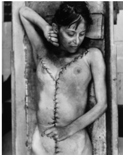
Woman who died in her sleep, 1972