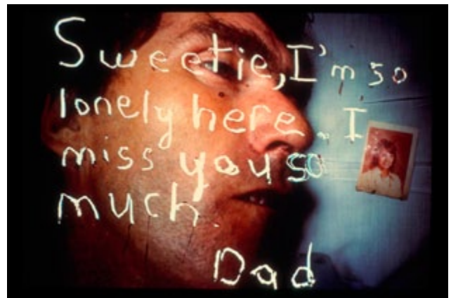
Note to my Daughter, Letters from the dead House, 1988