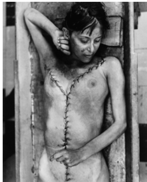
Woman who died in her sleep, 1972