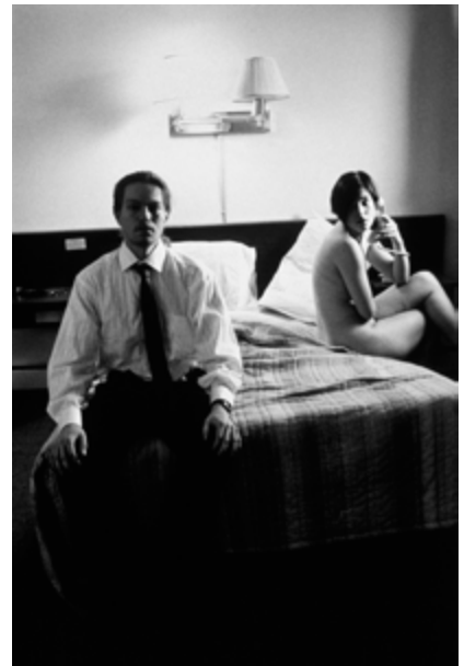
Couple, Detroit Motel, 1992

With Experiences of hardship, sadness, defeat as well as a growing numbers of tragedies of his own making, Mr.Lotus comes to understand that it is best to be a contribution to world much larger and much more interesting than he is, than to believe that he is the center of any birthing. For the first time he begins to accept living on life's terms and understands that he is not the world. Mr.Lotus now realizes that he must experience his own death, briefly but fully mourn while appreciating this death, and then bury his old self if we wants to live beyond his once exciting but now stale repertoire of possibilities. Only if he takes these steps can he gain something more, possibly a conscience and a spiritual understanding of living.