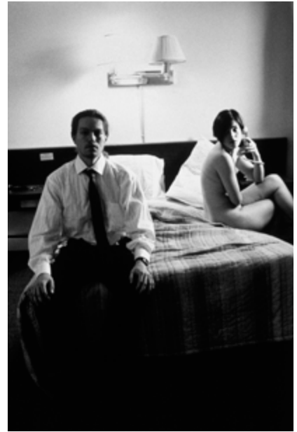
Couple, Detroit Motel, 1992